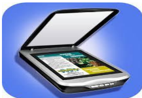
الماسح الضوئي : Scanner