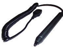
قلم ضوئي: Light pen