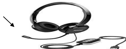
المصيح، المايك ، المايكروفون: Microphone