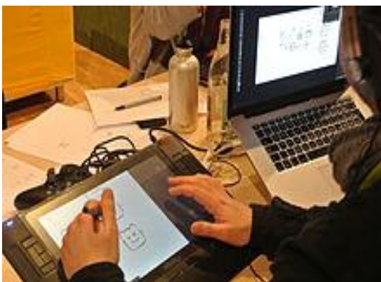
لوح رسم : Graphics tablet