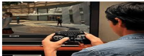
جهاز تحكم الألعاب : Game controller